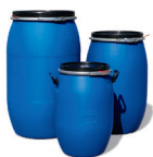
Spændelågsfad w. innerliner bag

Examples of container types for collection: